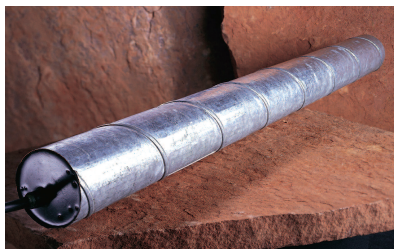
LIDA® Pack Canistered Wire Anode

LIDA® is a registered trademark of Industrie De Nora